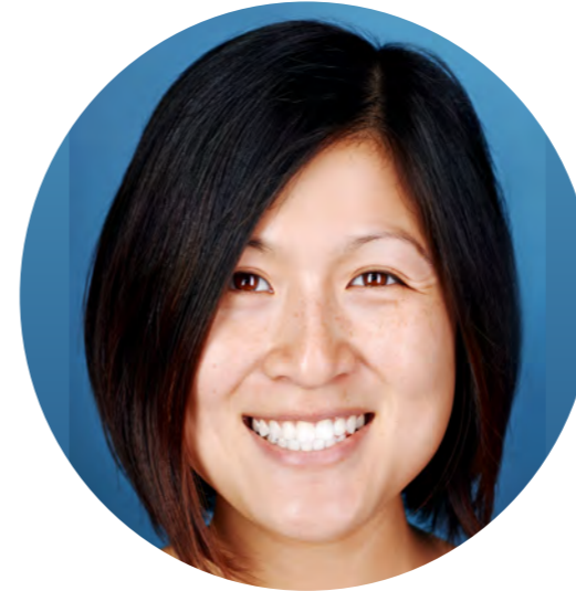
Source: Face Scan (liveness)